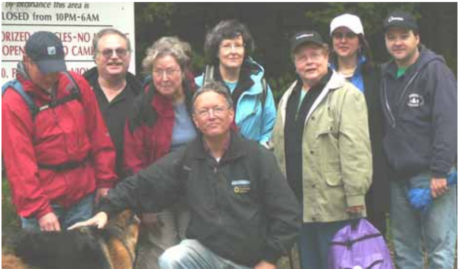
A group picture at the start of our morning hike in North Conway. From the Spring Mountain Climb.